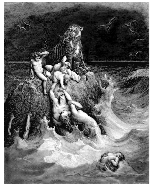
There was no where to escape to. The Flood finally covered everything.

With "The Flood", everything about the Earth changed. The protecting layer of water that was above the atmosphere, had come down in the deluge of rain. Now UV radiation could get through. The Continents were soon to split up and move apart. Ice caps were to form. And the kind of weather we know