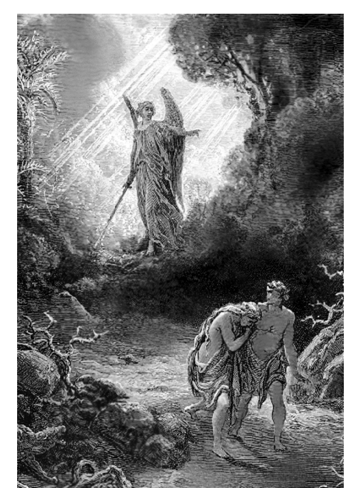
God appointed Cherubim and a flaming sword to guard the way back into Paradise and the Tree of Life.

And so it happened. God also threw mankind out of Paradise. Men were to work hard for food, and woman would have pain in giving birth, and were given their husbands to rule over them.