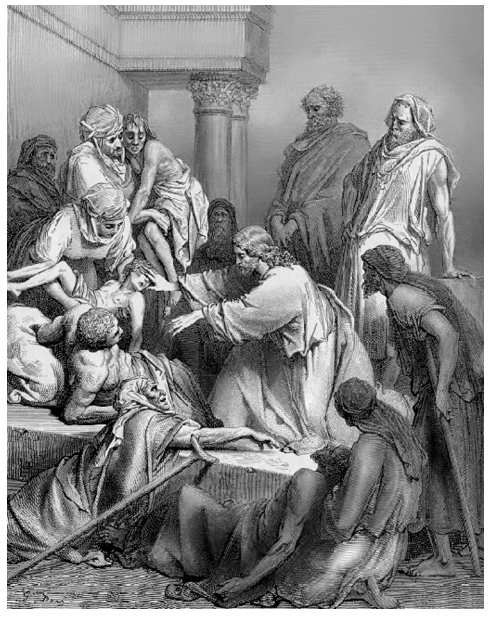
".. And he touched them and they were healed"

Another thing which God's Holy Spirit does is that He pours God's love into a believer's heart, and motivates them to do good things for